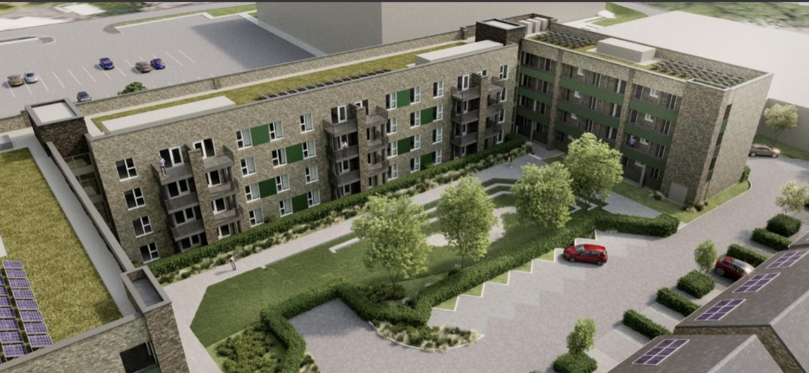
A Computer-Generated Image of the Proposed Development