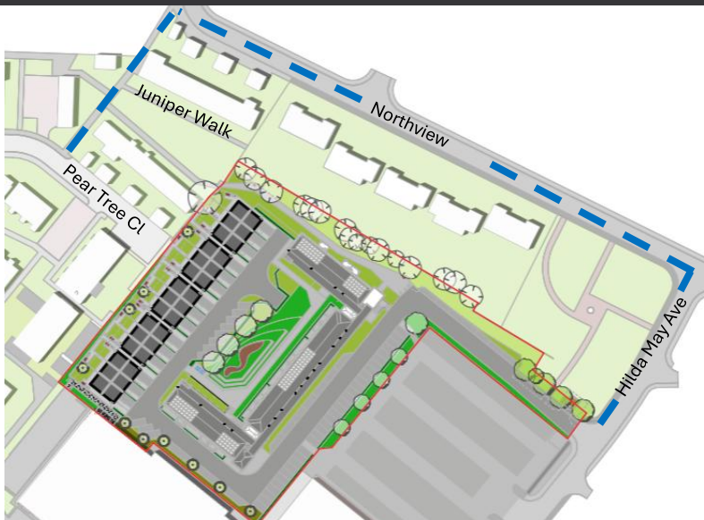
Alternative Pedestrian Route During Construction

A new pedestrian link connecting Hilda May Avenue to Juniper Walk and Pear Tree Close will be provided as part of the completed development.