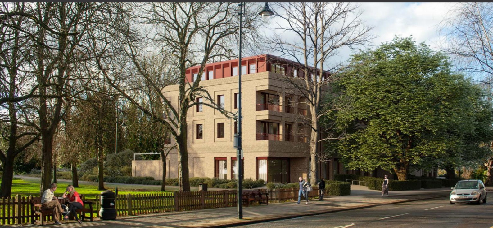
A Computer-Generated Image of the Proposed Development